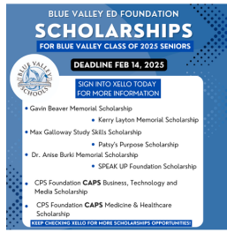
Blue Valley Ed Foundation Scholarship