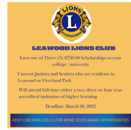
Leawood Lions Club Scholarship